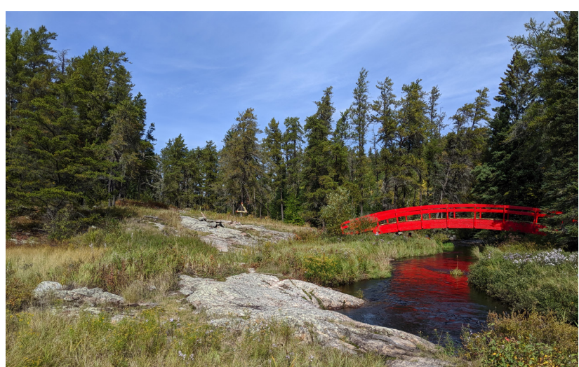
Hansons Creek Bridge.