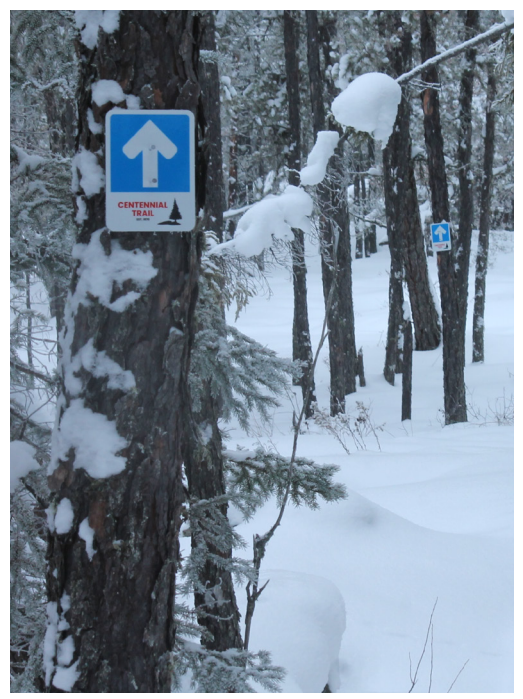
Hikers will follow directional signage